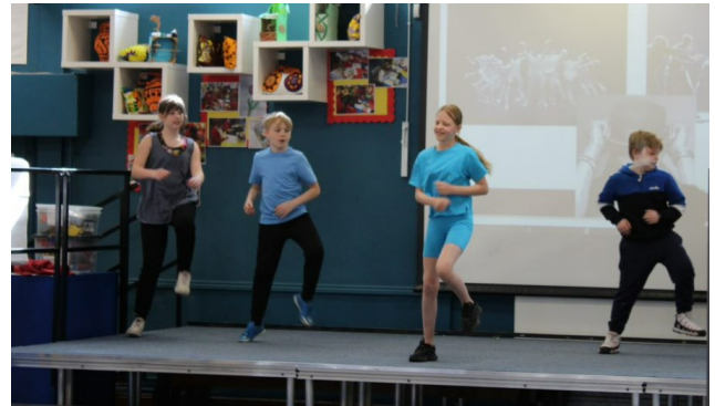
Above: some of the Year 5 children performing their group element of the dance.