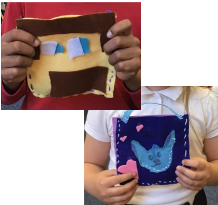
Above: two of the purses made by Year 3

Today, you'll be hearing about our D.T. project and what we have created. Firstly, we will introduce what we have created. We all created a purse from felt. The stitches we concentrated on were a running stitch, back stitch, over stitch and blanket stitch. I used back stitch for embroidery and French knots. Also for embroidery I used a running stitch to sew my ribbon to the felt. The last stitch I used was over stitch to sew the felts together. Everyone chose two colours of felt and used the spare felt to cut out patterns and doodles to sew on the felt for a design. What everyone found tricky was threading the needle, but everyone managed it.