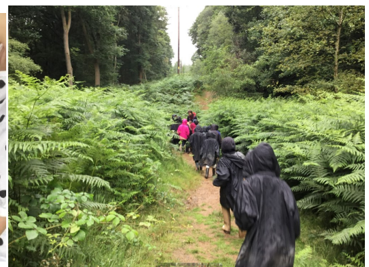
Above: pictures of our time at Frank Chapman