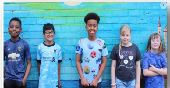
Above: Some of the Year 4 children raising money for toilet twinning.

Toilet Twinning was in May. It was for people who do not have a toilet at home or in schools. They needed help. We dressed in blue and we went to an assembly with a quiz by the eco committee. The quiz was funny and we were learning about the children who don't have toilets at school. We gave the teachers our money to give to the people who need toilets.