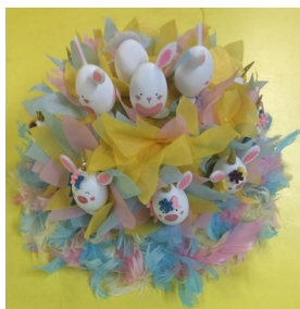
Nursery PM - Brayleigh