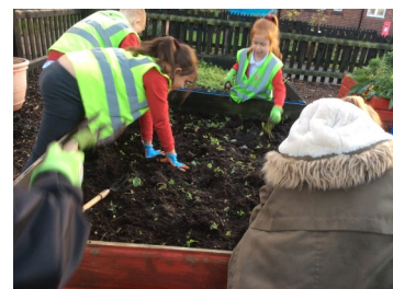
Tidying beds and planting shallots and garlic.