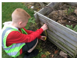
Measuring for signs